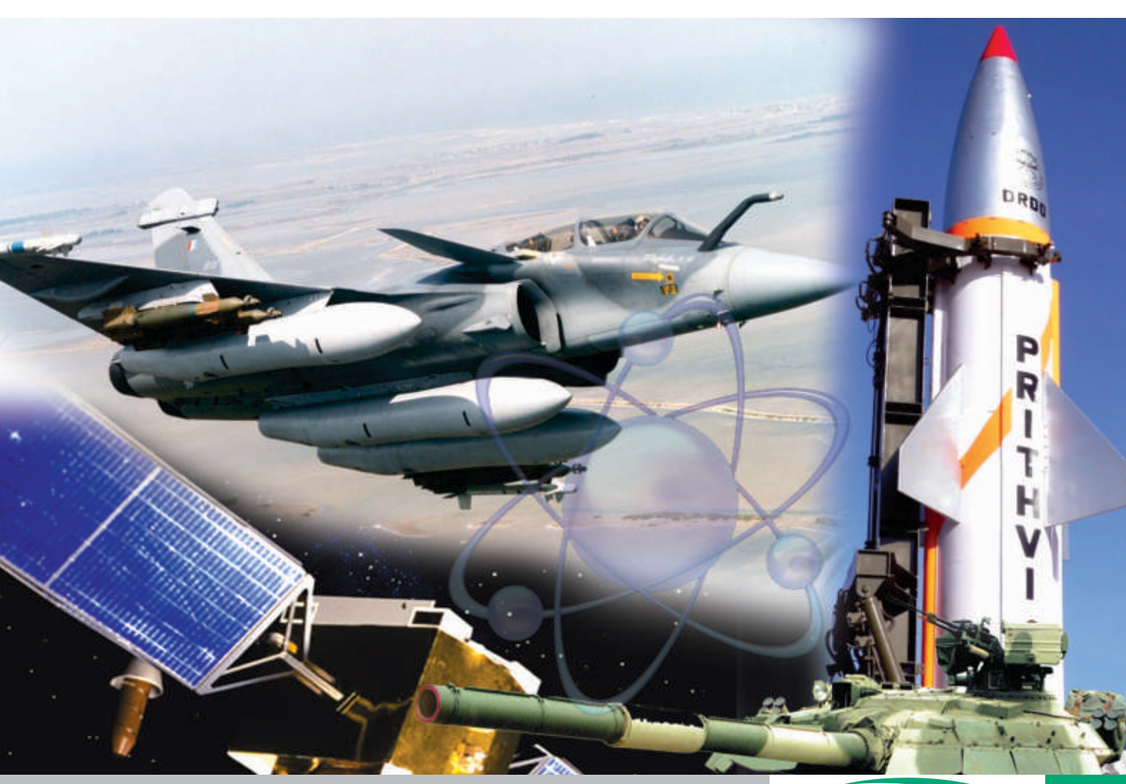
For Research & Defense application