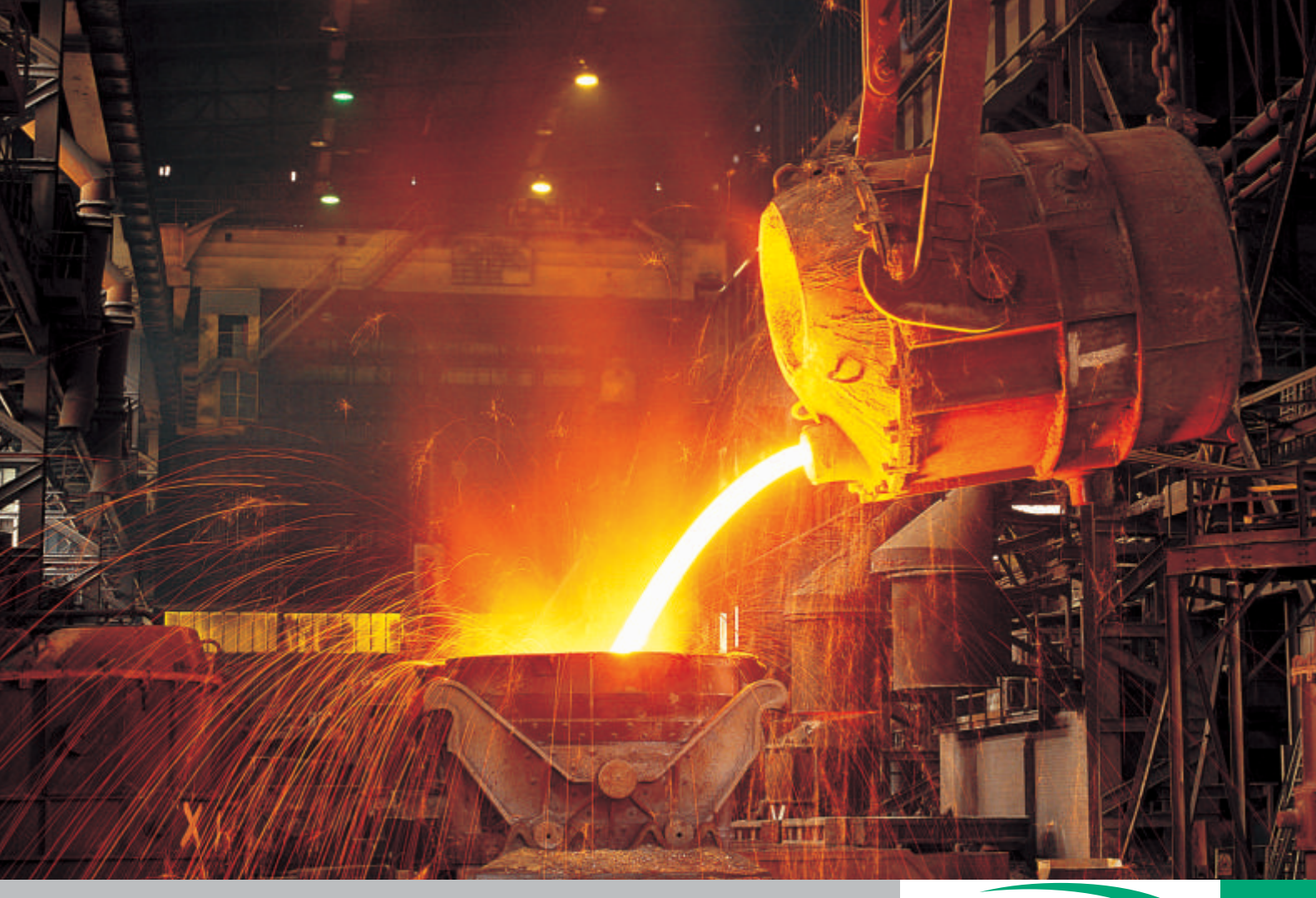
For Induction Heating & Melting Applications