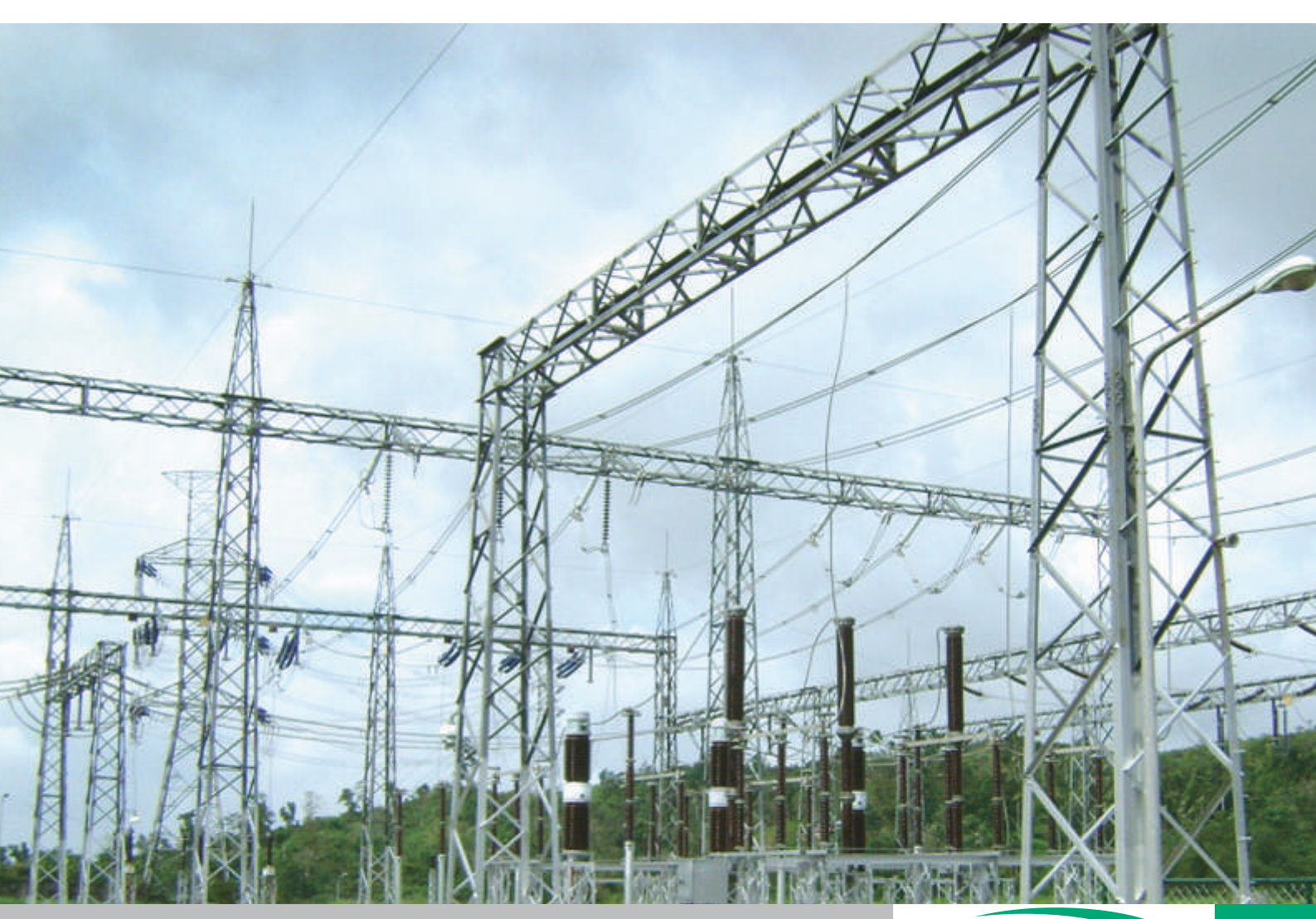
For Power Factor improvement & Harmonic Filter Capacitors